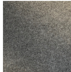
RASZ104 Asana Smoke