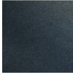
RASZ102 Asana Black