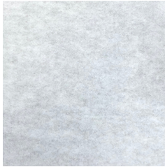
RASZ101 Asana Fog